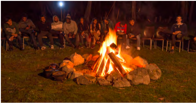
Holmesglen at Eildon offers student groups the opportunity to take part in a variety of adventurous and action-packed activities - all while immersed in some of Victoria's most beautiful natural landscapes.

Activity programs tailored to suit your learning outcomes.